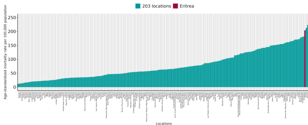
The length of each bar states the age-standardized mortality rate per 100,000 population associated with AMR in 2019.