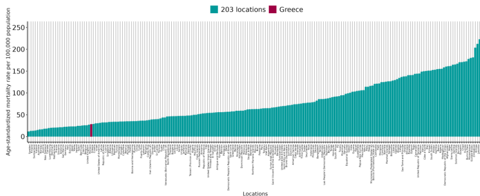
The length of each bar states the age-standardized mortality rate per 100,000 population associated with AMR in 2019.