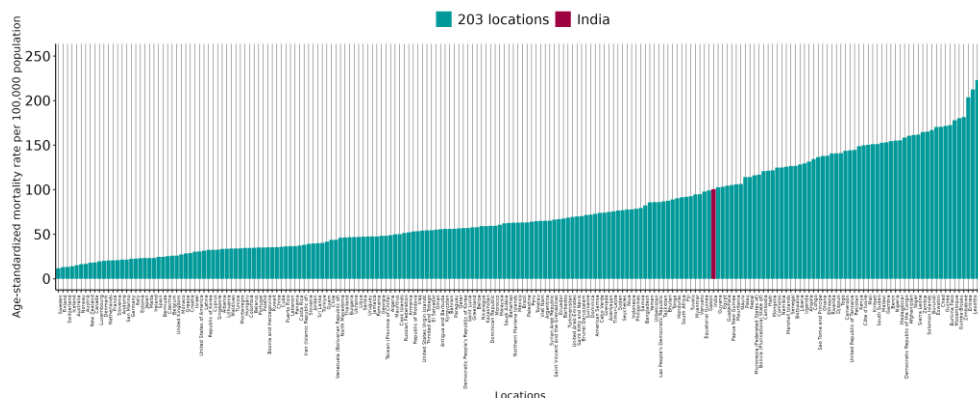
The length of each bar states the age-standardized mortality rate per 100,000 population associated with AMR in 2019.