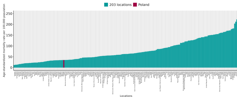
The length of each bar states the age-standardized mortality rate per 100,000 population associated with AMR in 2019.