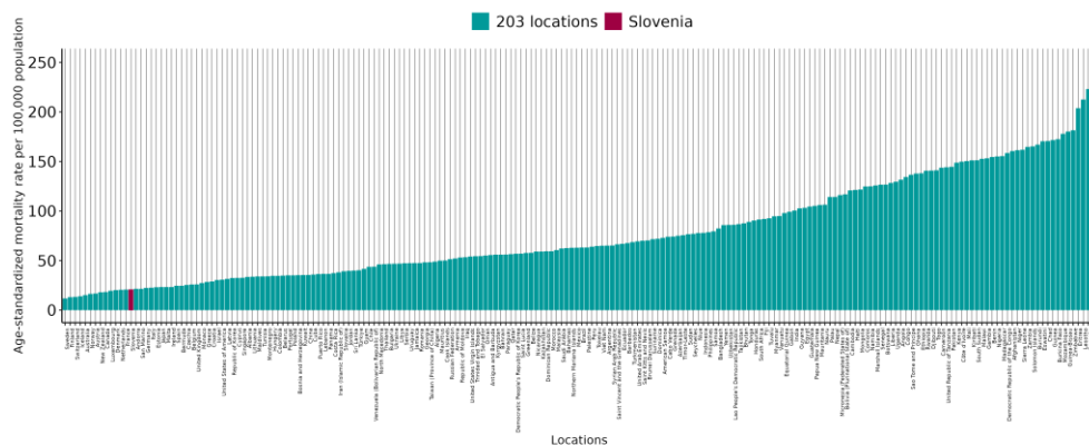
The length of each bar states the age-standardized mortality rate per 100,000 population associated with AMR in 2019.