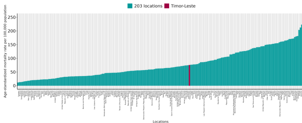
The length of each bar states the age-standardized mortality rate per 100,000 population associated with AMR in 2019.