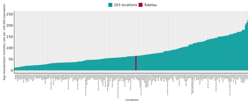
The length of each bar states the age-standardized mortality rate per 100,000 population associated with AMR in 2019.