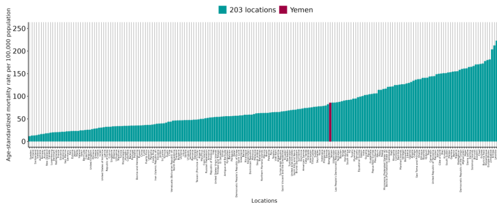
The length of each bar states the age-standardized mortality rate per 100,000 population associated with AMR in 2019.